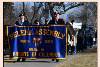
Below: Knights of Columbus lead the March around the Capitol.