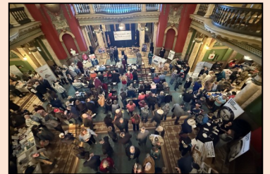
Above: Attendees from all over Montana fill the Capitol Rotunda.